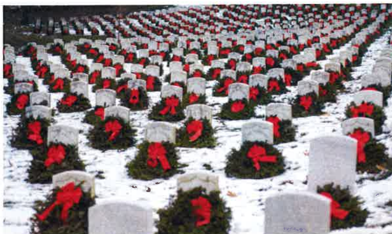
The above image, posted in 2005, helped to spread the word about the Wreaths Across America project and inspired the thousands of volunteers who have since participated.